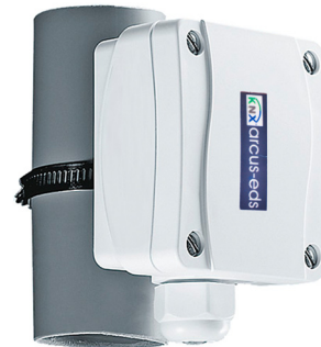
SK01-T-ALTF2 with Contacting / Tube Probe