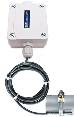
SK01-T-ALTF1 with Contacting / Tube Probe 1,5m ( PVC / Silicon )