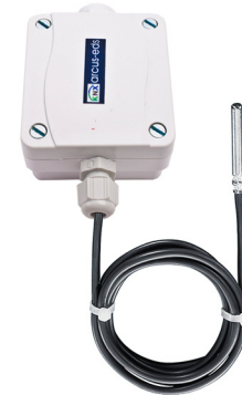
SK01-T-HTF with Sleeve / Cable Probe 1,5m ( PVC / Silicon / PTFE )

Article-No.: 30101002 / 30101003 / 30101055